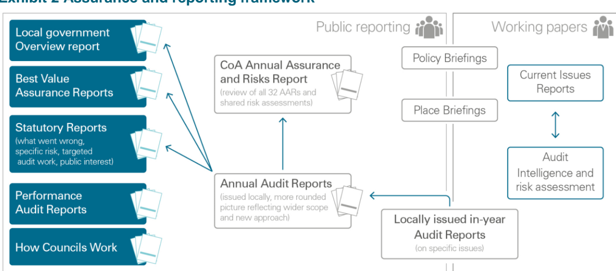
Exhibit 2 Assurance and reporting framework

10. The assurance and reporting framework for the new approach is summarised in Exhibit 2.